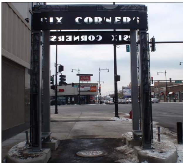
ABOVE: A sidewalk arch by Sears looking south. RIGHT: A nighttime view of our holiday banners.

The information kiosks also bring the beautification project to a new level. The kiosks at the Six Corners intersection, as well as by the Portage theater and by the Laporte Avenue lot, will provide a Six Corners map